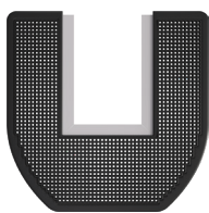
commode mat | black 1441BNT