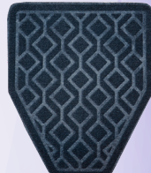
diamond splash carpet urinal mat black DSG1500