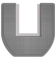
commode mat | gray 1441CGR