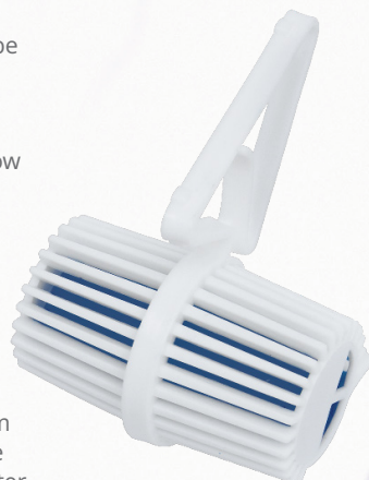
rim cage RC01

Once the Rim Cage is securely fastened, the enzymes will automatically work to deodorize unpleasant odors and leave behind a clean, fresh scent every time the toilet is flushed. Dispose after 30 days.